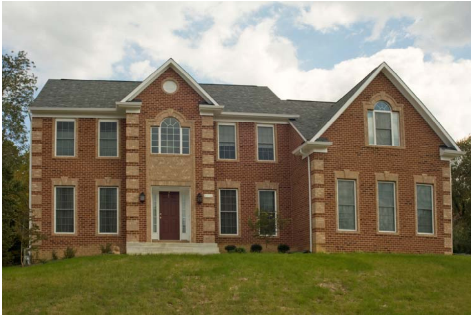
Above rendering is a representation, and may not be the actual elevation or color selection