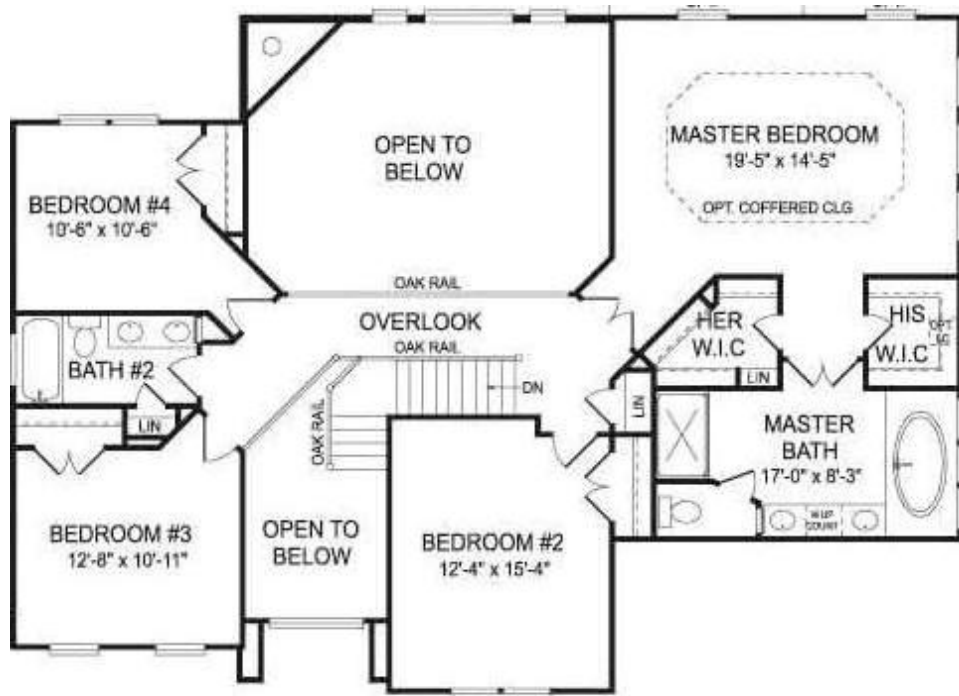
SECOND FLOOR PLAN - STANDARD THE YORKSHIRE MANOR